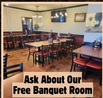
Ask About Our Free Banquet Room